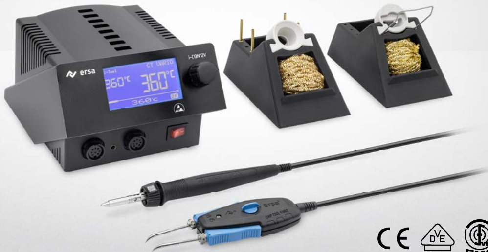
i-CON 2V MK2 with i-TOOL MK2 & CHIP TOOL VARIO