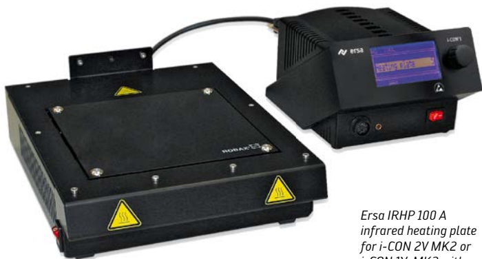
Ersa IRHP 100 A infrared heating plate for i-CON 2V MK2 or i-CON 1V MK2 with interface.