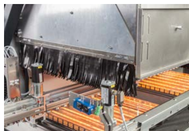
Power convection heating

The innovative and user-friendly ERSASOFT 5 software renders machine operation even more intuitive. Through individual user interfaces, each group of operators receives, at one glance, the data and information it requires. A further software highlight is the PiP technology (picture in picture) combined with a process monitoring camera.