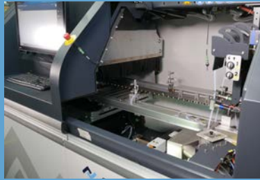
Soldering system for inline or batch operation