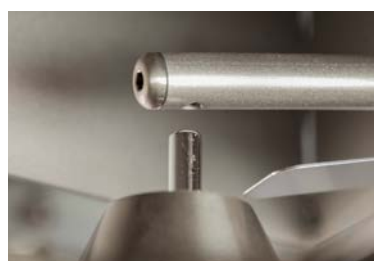
Automatic nozzle activation