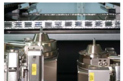
Y/Z variable dual solder pots