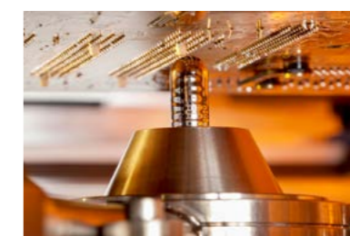
Maximum board size 508 x 508 mm