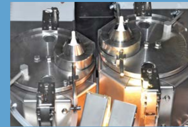
Solder module with two solder baths on the same axis