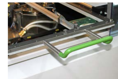
Convenient manual infeed + barcode scanner for automatic product identification

Operation and control of the ECOSELECT 1 is effected with the innovative and user-friendly ERSASOFT machine software. An integrated process recorder and the solder protocol guarantee traceability according to ZVEI standards. By means of the CAD Assistant solder programs can be created quickly and easily using CAD files or image files of scanned PCBs. The solder program created in this way can then immediately be used in the ECOSELECT 1.