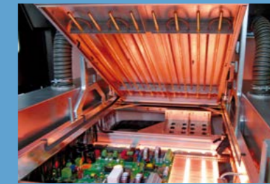
Dynamic preheating concept with top- and bottom-side heating